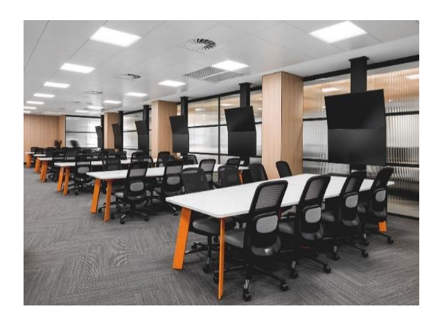
Figure 1: Medical School e-learning suite

Additionally, the format of delivering CBL content in a TBL format was facilitated by the institution's recent acquisition of key physical and technological resources. At about the time when the new TBL format was introduced in the Medical School, UWA was promoting a new Echo360 active learning platform (ALP), designed to go beyond passive lecture captures and encourage active engagement of students. The Medical School has also recently invested in building several e-learning suites with each suite accommodating 15 tables and two large 40-inch LED screens at each table (Figure 1). 8 students could be assigned to each table as their BYOD could be connected wirelessly to the LED TV screens. The design of the e-learning suite encourages collaborative study, enabling students to 'huddle together' in groups whilst discussing the cases presented, as well as engaging with activities in the ALP shown on the LED screens. The ALP employs a number of active learning tools, including real-time polling in which results are shown immediately to stimulate further discussion, 'live' Q&A to further facilitate inter-group discussions, and other functionality that promote formative and summative assessment. Two repeated TBL classes were scheduled back-to-back in a 2-hour 120-students class, optimising the use of teaching staff time.