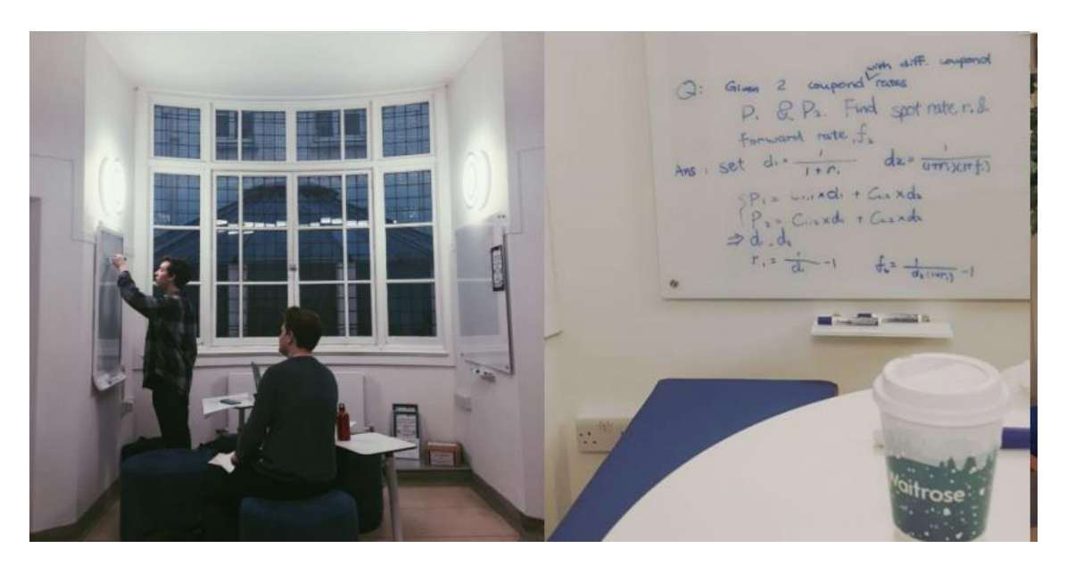
Picture 2: Students engaging in making in the Rotunda Learning Spaces (shared via Instagram)