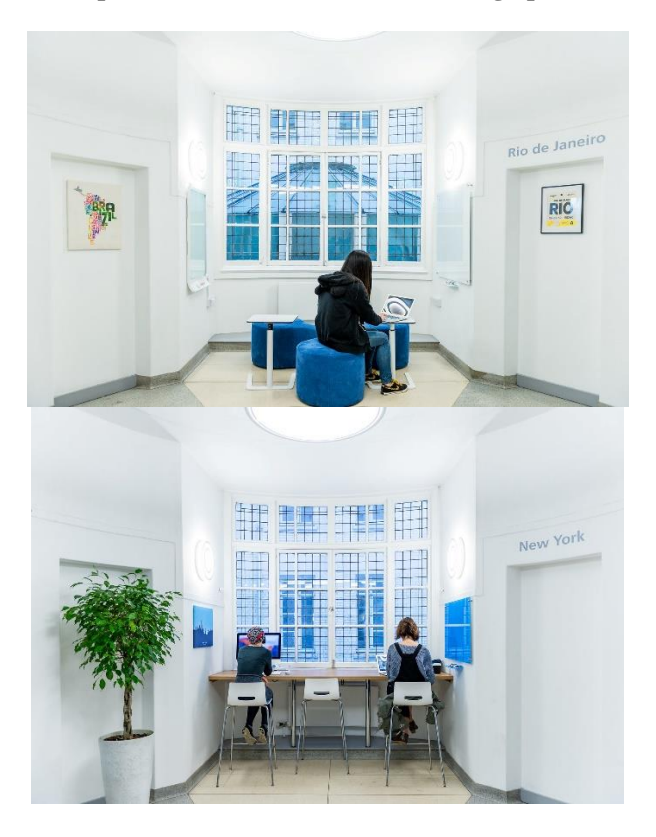
Experiment 1 - The Rotunda Learning Spaces

community of and cultures they were chronicling through various media sharing social media. Through tour evaluation of the SAP projects we began to observe different forms of making that were manifest in processes such as debate between competing positions on critical problems, theory development and challenge, digital storytelling and student-led ethnography and collaborative problem solving. Supporting how students engaged in these forms of making outside the classroom and in the time and spaces they used for self-study, groupwork and assessment presented challenges, such as the increasing inappropriateness of the dominance of single seat study spaces and quiet areas. The challenge for the School was to design learning spaces that facilitated, both physically and technologically, these emergent forms of social science making so that students felt they were provided with the support and encouragement to engage and participate collaboratively.