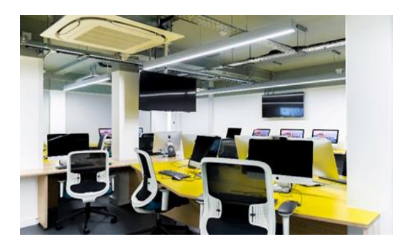
Picture 3 – The Hive Studio, showing collaborative screen sharing (left) and writable problem-solving booth (right)

The space featured multiple ways of supporting social science making, from the capacity to make and edit media on high-spec editing Macs, through to screen sharing in pods of computer (see Picture 3 – left). The space also supported more physical ways of making through in the form of problem-solving booths inside and outside the room. There were writable surfaces everywhere in the space, including behind the computers. Aesthetically, we drew on the design of co-working spaces (lights, exposed industrial ceiling etc) to signal to students that this was not a normal computer room. The colours of the furniture and room thematically linked the room and the kind of activity we were foreshadowing by calling the space 'The Hive Studio'. In the early post-occupancy observations, we did not see evidence that the loud nature was being subverted, however as with the RLS the technology that was introduced was underutilised, resulting from either a reticence to use it or a lack of understanding that it was