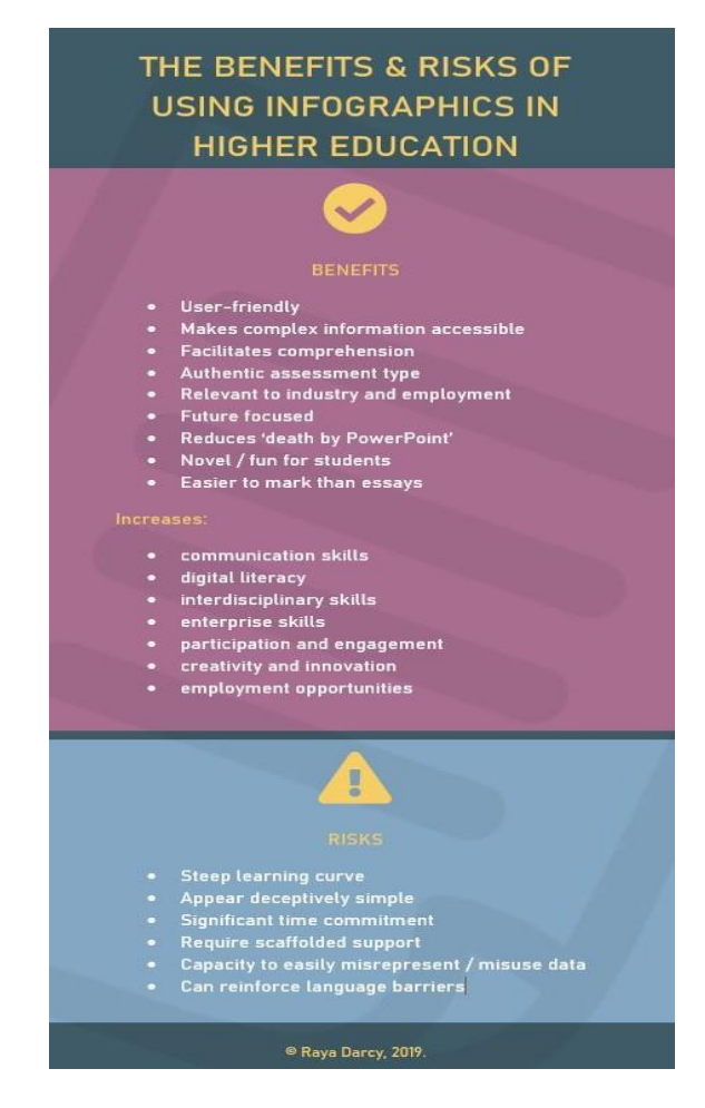
Figure 1: Infographic on the benefits and risks of using infographics in higher education.

Keywords: infographics, assessment, digital literacy, public health