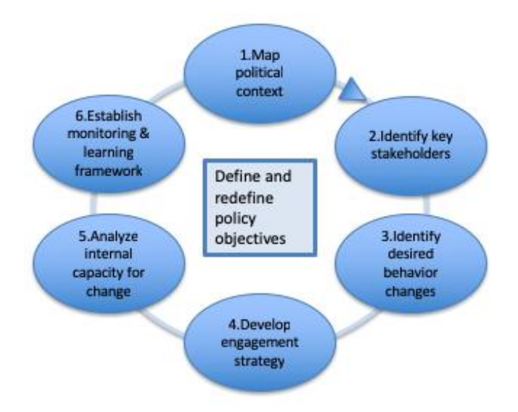
Figure 1. Adapted version of the ROMA model used by the SHIELA project (Tsai et al. , 2018) and by Hainey et al. (2018).

This was conducted through a series of semi-structured interviews, focus groups and workshops with members of the University Senior Leadership Team (n=12), Faculty Deans and Associate Deans, academic and professional staff of the University Faculties and Central Service Units (n=39), and students (n=6). The data collected was analysed along the six dimensions, of: (1) mapping of (political) context; (2) identifying key stakeholders; (3) identifying desired behaviour changes; (4) developing an engagement strategy; (5) analysing internal capacity to effect change; and (6) establishing monitoring and learning frame-works (as demonstrated in Figure 1). All data was validated by the LA roundtable group (see details below).